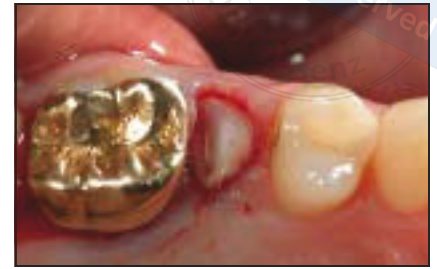
Fig 3 (left) Clinical situation 6 months postoperative.