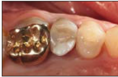
Fig 2 (right) Tooth extraction and ridge preservation using DBBM and collagen membrane (Tx3).